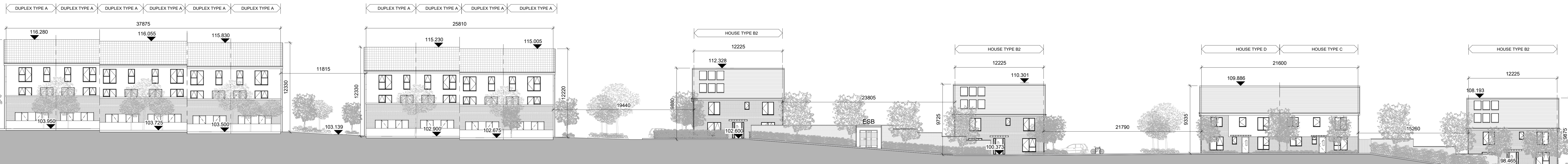
CONTIGUOUS ELEVATION 1-1 (LEFT) 1:200